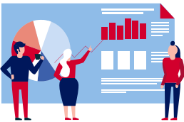
Technology, Data and Research