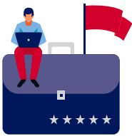
Professional Development Skills