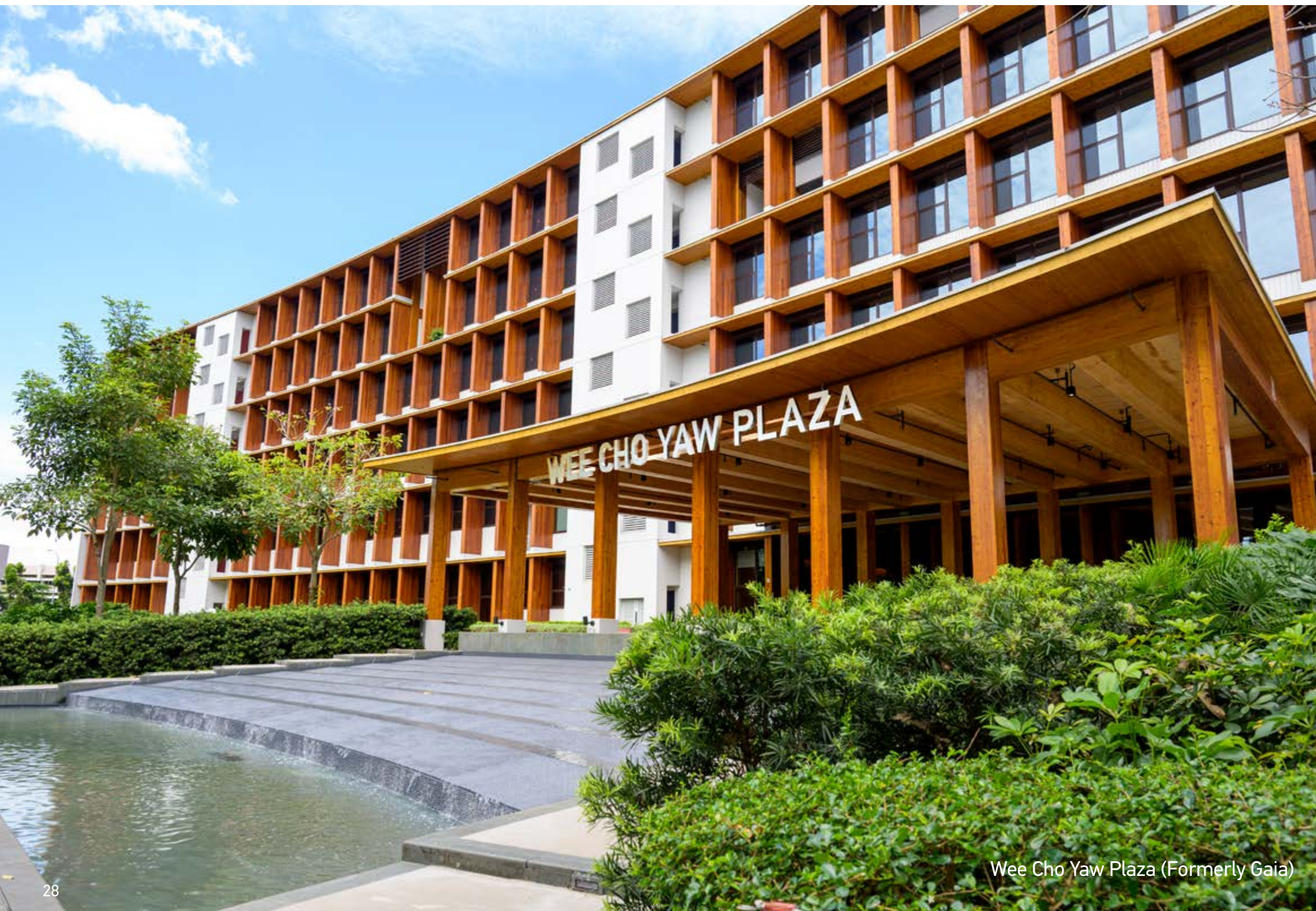
Wee Cho Yaw Plaza (Formerly Gaia)

It's a building created with the future in mind, for the future leaders who study here.