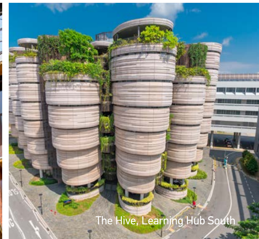
The Hive, Learning Hub South