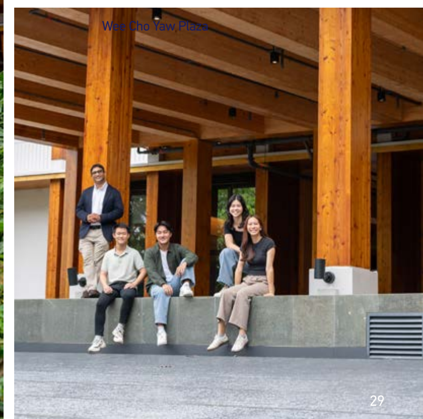
Wee Cho Yaw Plaza