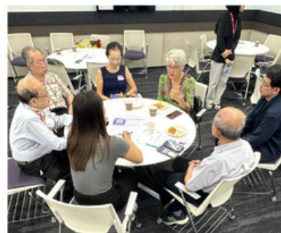
Primary Care Multimorbidity Seminar on Healthier SG Ischaemic Heart Disease Care Protocol 16 Nov 2024