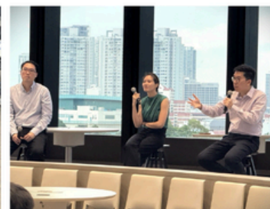
Primary Care Multimorbidity Seminar on Healthier SG Chronic Kidney Disease Care Protocol 28 Sept 2024