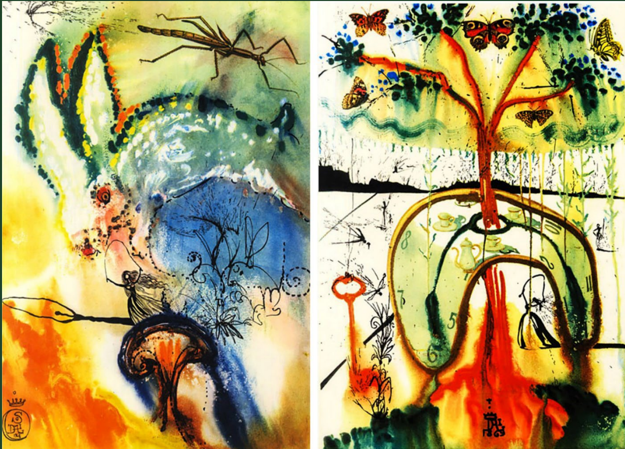
Salvador Dali, Illustrated Alice in Wonderland (1969)