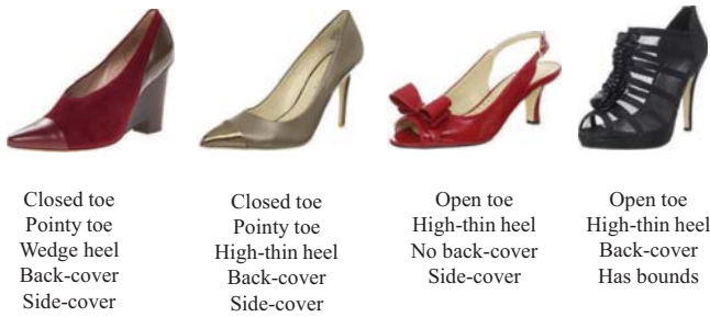
Fig. 4. Examples of shoe image tagging

from which complementary features are extracted and combined for the final attribute prediction. The evaluation on our newly constructed pump shoe dataset verifies the effectiveness of our approach.