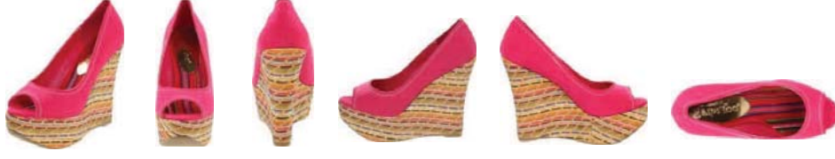
Fig. 1. The six representative viewpoints of a shoe