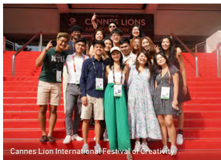
Cannes Lion International Festival of Creativity

Students will meet with new media leaders at the annual conference in Austin, Texas to explore cutting-edge developments including artificial intelligence, augmented reality and interactive storytelling.